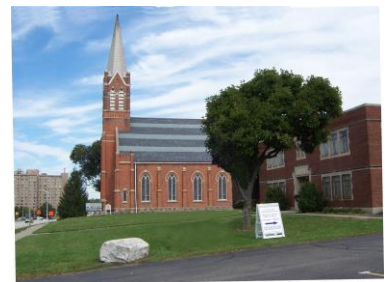
St. Vincent de Paul Church